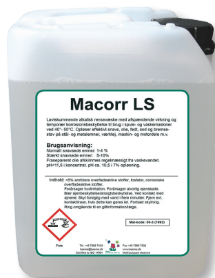
Macorr LS 5 liters dunk Varenummer: 111243