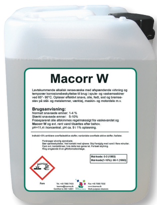
Macorr W 5 liters dunk Varenummer: 111233