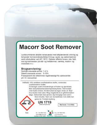
Macorr Soot Remover 5 liters dunk Varenummer: 111253